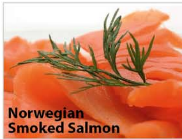
Norwegian Smoked Salmon