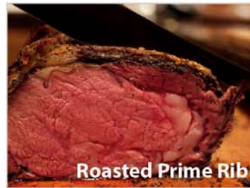
Roasted Prime Rib

Member: Adult $590p.p./Children $290p.p. (3-11 years) Non-Member: Adult $690p.p./Children $390p.p. (3-11 years)