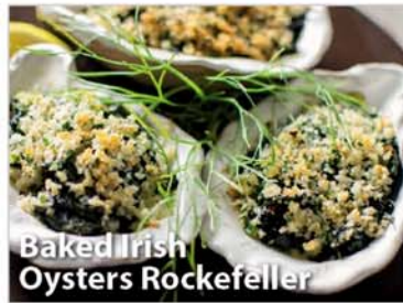
Baked Irish Oysters Rockefeller