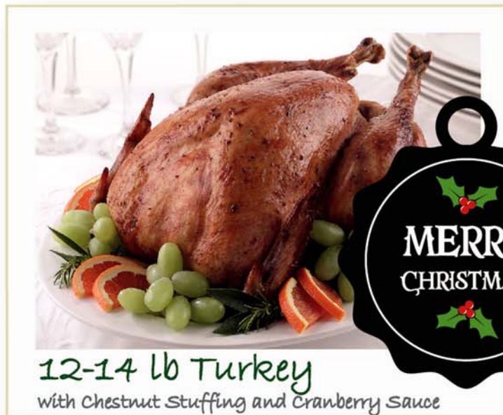
12-14 lb Turkey with Chestnut Stuffing and Cranberry Sauce